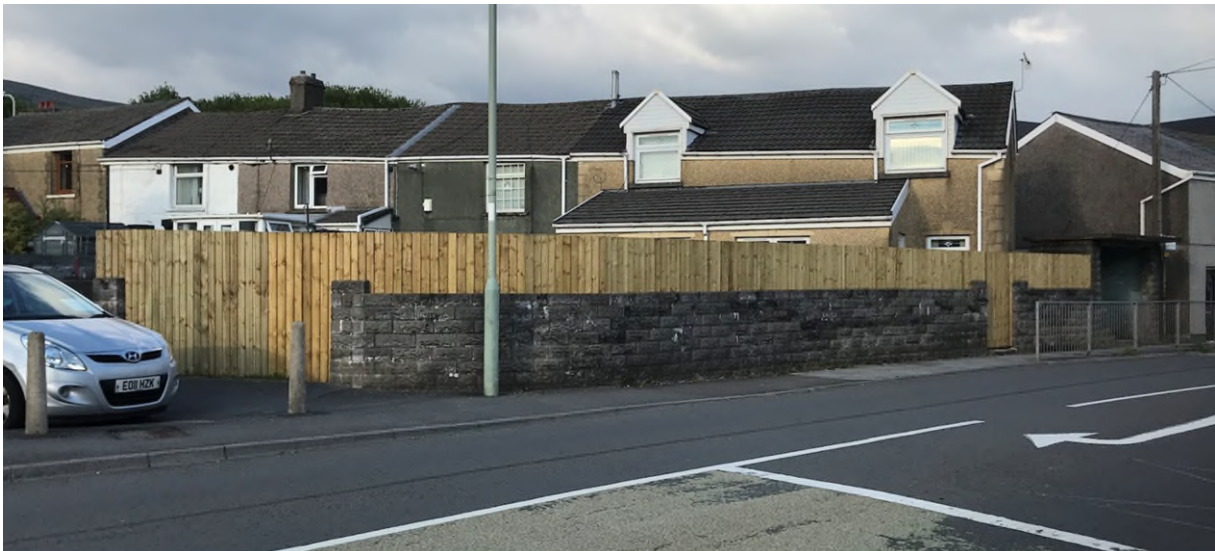
Figure 1 - Photograph of Enclosure

The application site relates to an end of terraced, two-storey property located on a prominent corner of Crown Row with Bridgend Road. Access to the property is located to the rear of the properties off the main highway via Crown Row. The application site is located within a predominately-residential area which are surrounded by similar properties, with similarly designed enclosures to that subject to this application.