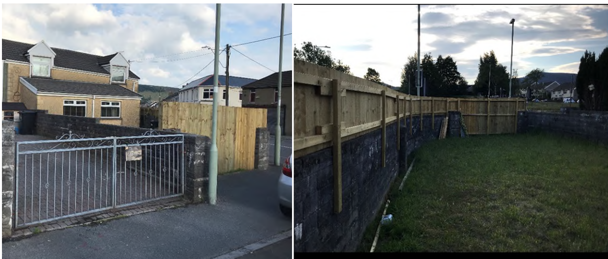
Figure 3 – Photographs of side and rear fence in relation to neighbouring property

Due to the side location, its position fronting the main highway and the reduction in the height of the rear fence, it is considered that the development has no significant adverse impact on the amenities that the neighbouring properties currently enjoy and therefore the development accords with Policy SP2(12) of the BLDP(2013) and the Council's Supplementary Planning Guidance SPG02: Householder Development.